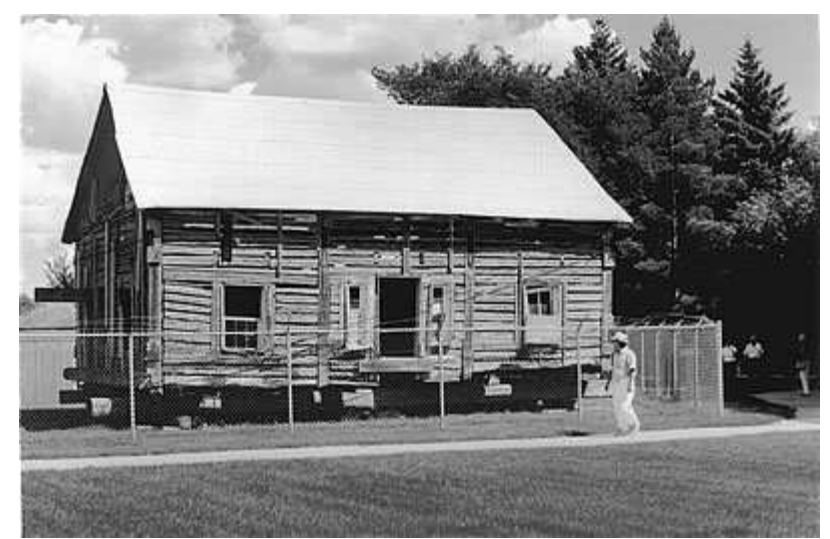
Delorme house (built in 1850s) was moved from River Lot 21 at Pointe Coupée (St. Adolphe) to its present location at St. Norbert Provincial Heritage Park. The house has a post and sill construction known as Red River frame construction.