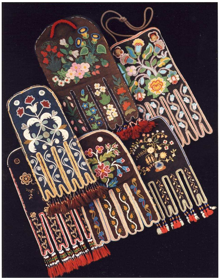
Octopus Bags from the Canadian Museum of Civilization Collection, K89-805

Metis "fire bags" now called octopus bags are based on the animal skin bags made by the Algonquian Indians. These are case-skinned bags which the Saulteaux of Manitoba used to call "Many Legs Bags" because the legs and tail were left on and were quill-worked or beaded. Shown below are otter skin bags used in Midewiwin ceremonies. Although otter pouches such as these are often associated with the Midewiwin or Medicine Society of the Great Lakes region, they were also widely used on the Plains as tobacco and pipe containers.