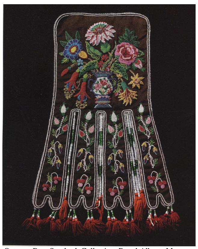
Octopus Bag, Southesk Collection, Royal Alberta Museum Red River Metis attribution.

Metis designs sometimes contain the "X" and cross motifs which suggest the cardinal directions as well as Ojibwe spiritual concepts. According to David Penney<sup>3</sup> the designs are "pictorial or diagrammatic metaphors of a larger, sacred universe;" the four quarters and asymmetrical design reconcile opposites, just as the cosmos creates balance and harmony. Asymmetrical yet balanced designs and compositions are also suggestive of male-female balance and harmony. The asymmetry and alternating elements express Ojibwe spiritual concepts; they visually reconcile opposites, just as the cosmos creates balance and harmony. For a discussion of how Native American women transformed missionary-taught floral designs into their own stylized beadwork see "Floral Decoration and Culture Change: An Historical Interpretation of Motivation" American Indian Culture and Research Journal 15:1 (1991): 53-77.