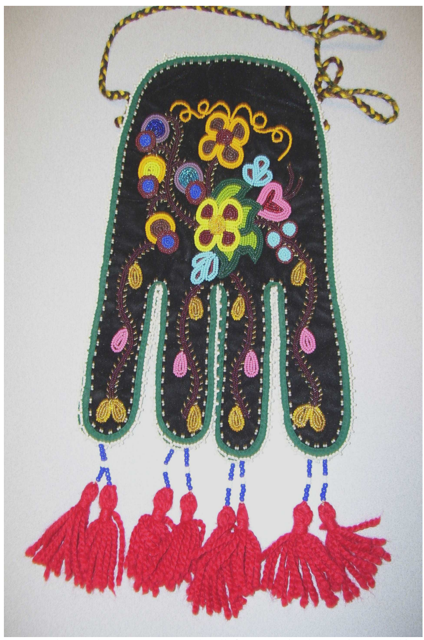
Octopus bag made by Lawrence Barkwell, from a design by Jennine Krauchie, 28cm x 49cm. On black velvet with wool tassels.

The Red River Metis octopus bag, shown above, collected by the Earl of Southesk in 1849 is beaded on brown Stroud with very small beads (#18). The design is asymmetric yet balanced. The X pattern formed by the placement of the motifs is quite evident.