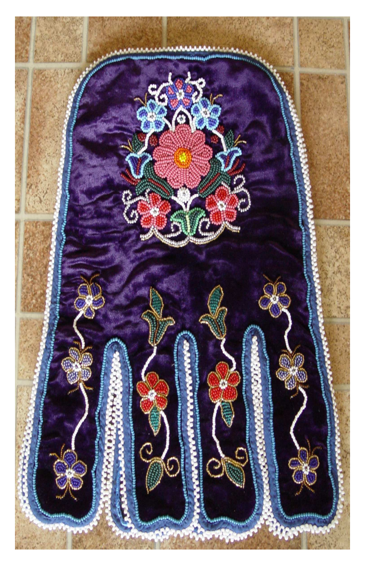
Octopus bag made by L. Barkwell, #10 beads on purple velvet. The white beaded edging is done in "zipper stitch" style.

1840s. The floral art of the Métis bags appears to have strongly appealed to the Cree women; it motivated them to develop a floral style of beadwork that became a hallmark of Cree art in northern Manitoba and northern Ontario.