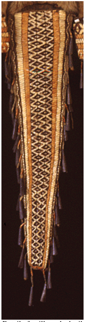
Detail of quill-worked tail

"children of the fur trade". The Métis were employed as canoe peddlers, while their women made a living with the production of snowshoes, moccasins, and other garments for the traders and their native customers.