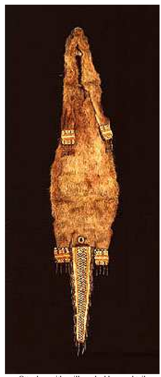
Otter bag with quill-worked legs and tail

Noted curator Ted Brasser<sup>2</sup> explains the origin of octopus bags thus: