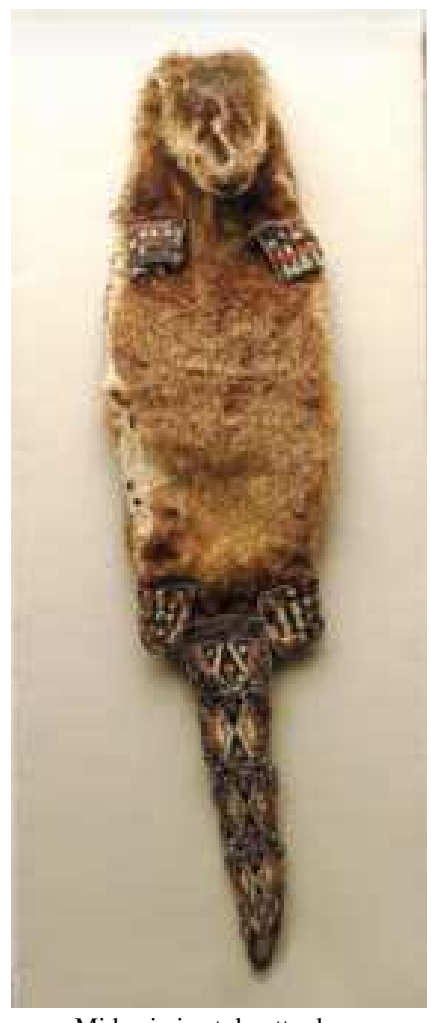
Midewiwin style otter bag.

The Metis originally called these "fire bags" or shot pouches because they were used to carry flint and steel, tobacco and pipes or for ammunition. Art historian Kate Duncan argues that the tabbed fire bags of the Metis developed among the Metis people of the Lake Winnipeg area and gradually through trade made their way to the Tlingit people of the Northwest Coast. Because these bags had the eight arms of the "devilfish" or octopus they were used to catching, these bags with their four double pendants suggesting the tentacles of the octopus eventually became known as octopus bags and the name made its way back east to the area of origin.<sup>1</sup>