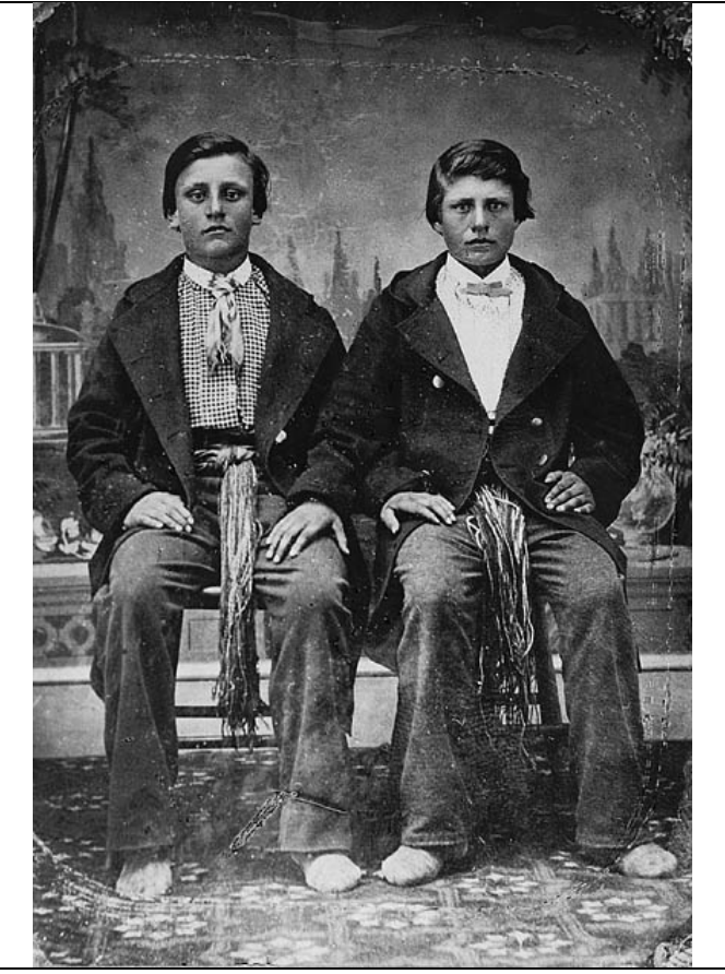
Chodes foreplo Miel. Chorles esterlin qui a une dhanisle canantei. Fapris un Boguvre de 1841.